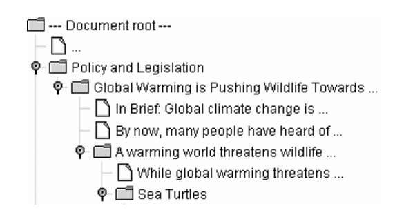
Figure 2: An example output of the proposed system.

In the proposed system, each document is modeled as a sequence of text units. We define a text unit u_i as a text fragment delimited by a new line (Figure 1). The output of the proposed system is the sectional hierarchy where headings and subheadings are at the intermediate nodes and other text units are at the leaves (Figure 2). A graph corresponding to an example hierarchy is given in Figure 3. The nodes are arranged from left to right according to their order of appearance in the document.