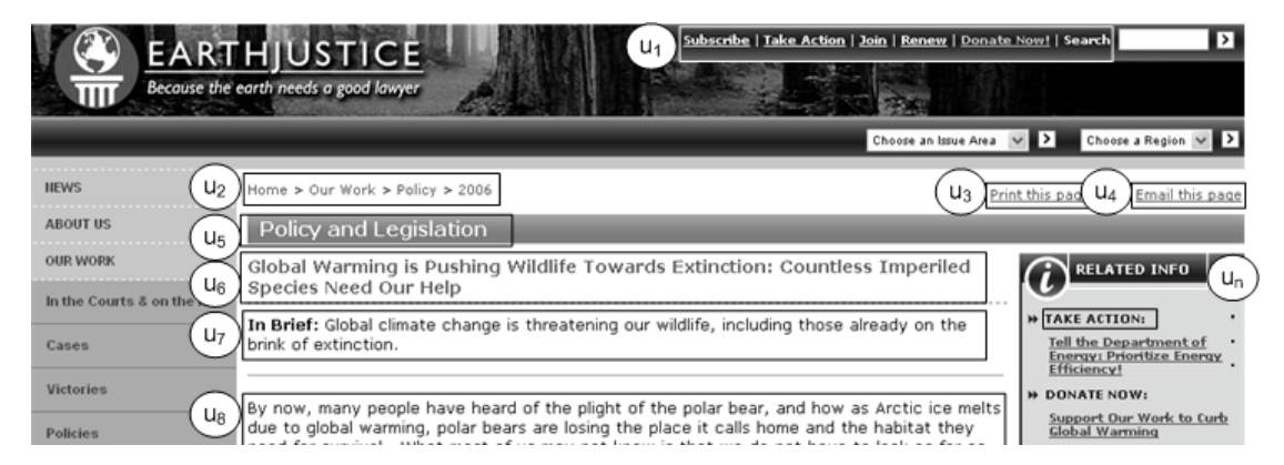
Figure 1: Part of an example HTML document.

of such an approach is to automatically generate a table-of-contents for a book (Branavan et al., 2007).